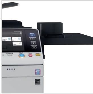
Optional off-line stapler