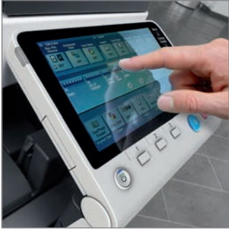
7" multi-touch colour control panel with 10-key pad (optional)

RECYCLED MATERIALS FOR REDUCED ENVIRONMENTAL IMPACT