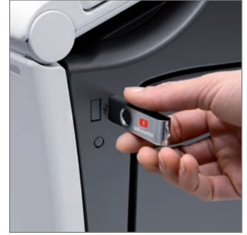
Direct printing and scanning with USB Memory Stick. Direct Printing of Microsoft Office formats (OOXML)