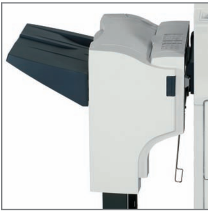
DF-730 FINISHER with a 1,000-sheet output capacity tray