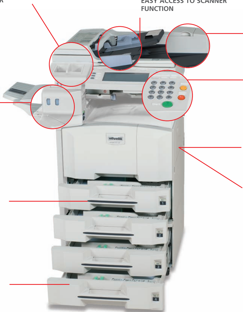
BY-PASS FUNCTION for special paper formats