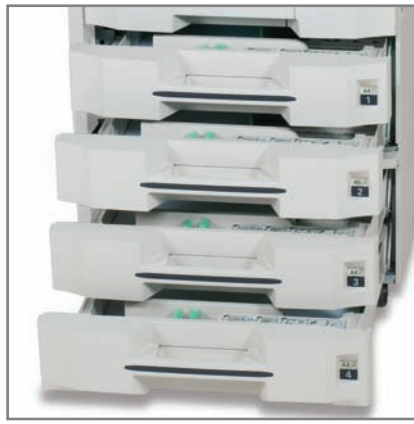
4 UNIVERSAL CASSETTES for a maximum paper capacity of 2,200 sheets