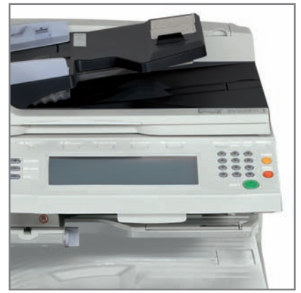
ADJUSTABLE TOUCH-SCREEN PANEL with intuitive menu